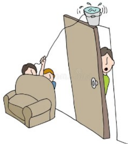
Spoken with anger / irony / sarcasm