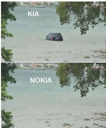
Spoken with joviality