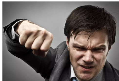
Spoken with aggression