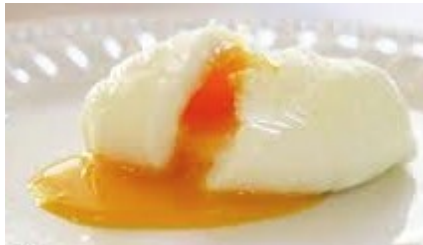
Poached egg (in water)