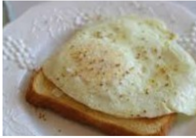
Fried egg – over easy 1