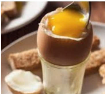
Soft boiled egg