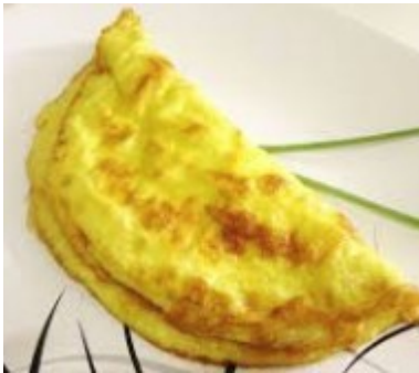
Omelet (USA) / Omelette (UK)