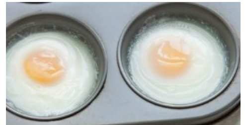
Poached egg (in steam)