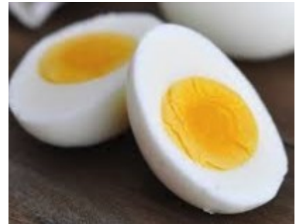
Hard boiled egg