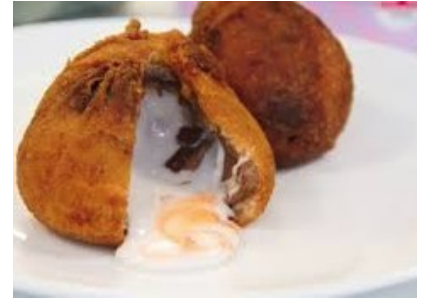
Fried egg in batter