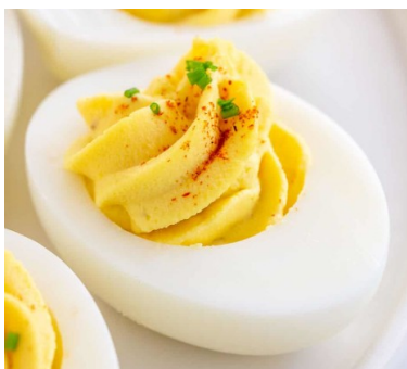
Deviled egg 2