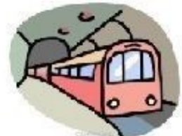
metro / subway / tube / underground