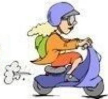
moped / vespa / scooter