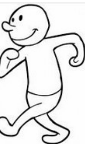
on foot (walk)