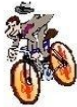
bicycle / bike