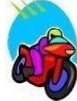
motorbike / motorcycle