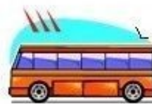
bus / coach